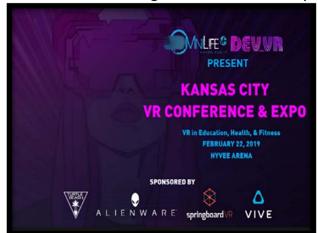
OmniLife & DEV VR Conference & Expo Information