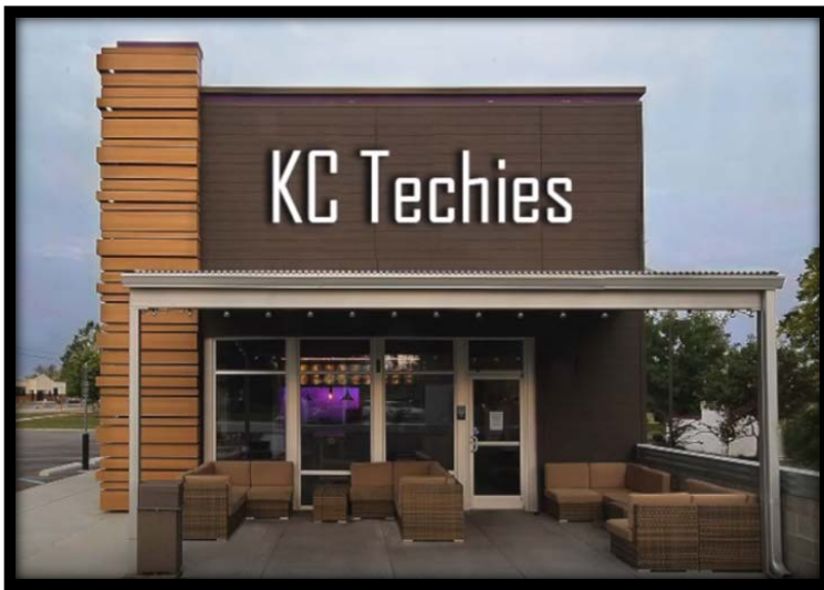
Better Business Bureau Video Competition entry for Southland CAPS Technology Solutions. Voting Link: https://www.bbbvideocontest.org/kansas-city/video/kc-techies-reviews/